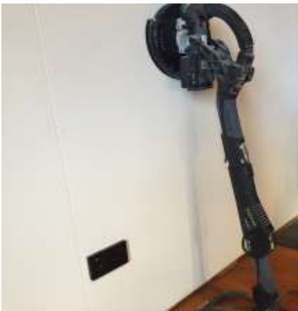
Recommended mechanical sanding equipment