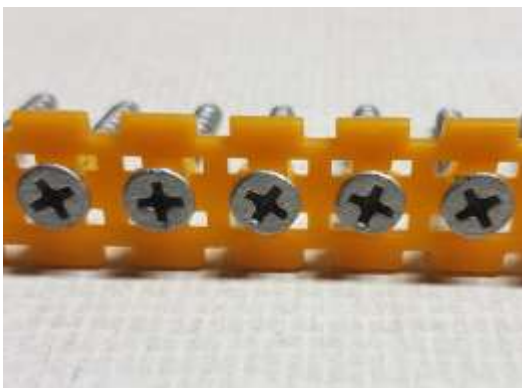
Fortress Fasteners 6g x 32mm C3 Galvanised Collated Square Drive Screws code FCS632CL3COL for fixing Magnum Board to timber framing