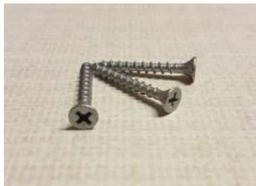
Fortress Fasteners 6g x 32mm C3 Galvanised Collated Square Drive Screws Individual code FCS632CL3J for fixing Magnum Board to timber framing