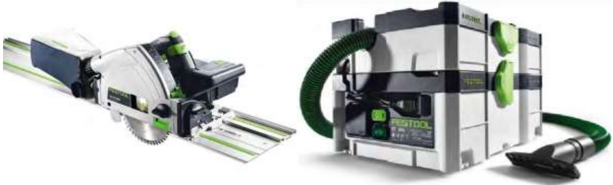
HEPA extraction system with recommended cutting equipment