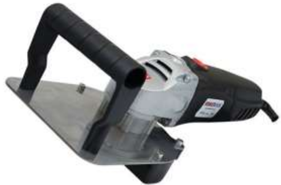
Rebating Tool Available from www.potters.co.nz