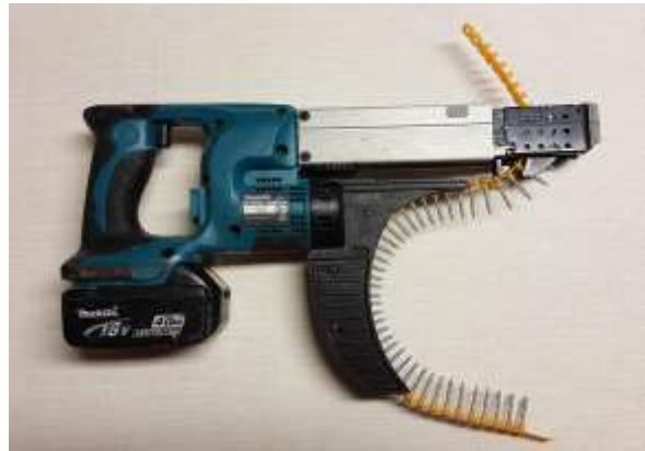
Auto Screw Gun