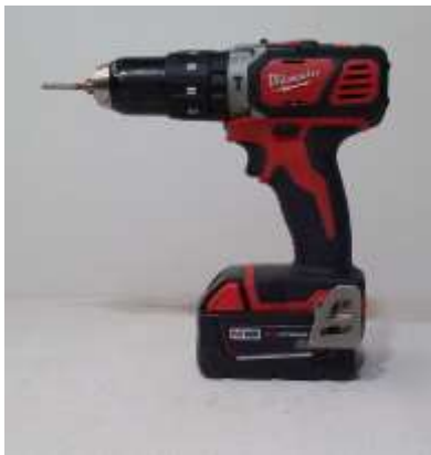
Battery powered drill gun with torque controller