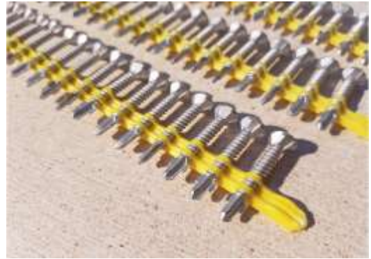
Simpson Strong Tie 8g x 32mm C3 Galvanised Wing Tip Collated Square Drive Screws code CBSDG114SA for fixing Magnum Board to steel framing